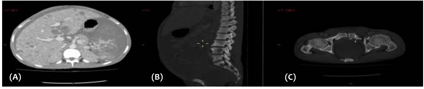
Figure 2: (A) Axial portovenous phase: Extrahepatic involvement with lesions replacing splenic parenchyma, becoming more Hypodense on portovenous phase- a pattern seen in hemangiomatosis. (B) Sagittal section bone window: Extrahepatic involvement with hemangiomas is L4 and S1 vertebral bodies. (C) Axial section bone window: there were changes of bilateral avascular necoriss in femoral heads, proposed cause in our case.

Figure 1B axial, coronal and axial delayed images: On portovenous phase, centripetal pattern of enhancement was noted. Interestingly, retention of contrast was noted on delayed phase with lesions appearing hyperattenuating in comparison to bachground hepatic parenchyma. These lesions suggested internal blood products.